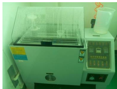
salt spray tester