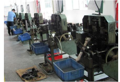
Automatic punching machine for male pin