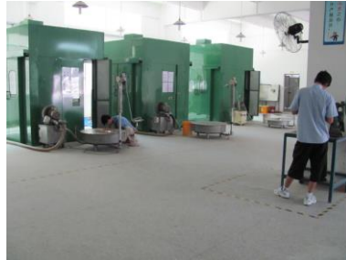
Automatic punching machines for terminals