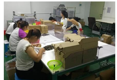
Visual inspection and Package Room