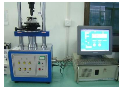
Insertion and Withdraw force tester: