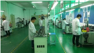
production line of connector automatic assembly

Below are parts of our production facilities: