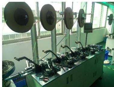
automatic assembly machines for female connectors